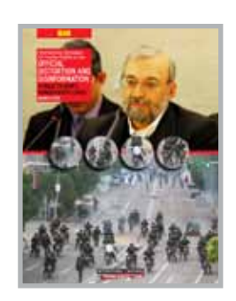
Official Distortion and Disinformation: A Guide to Iran's Human Rights Crisis