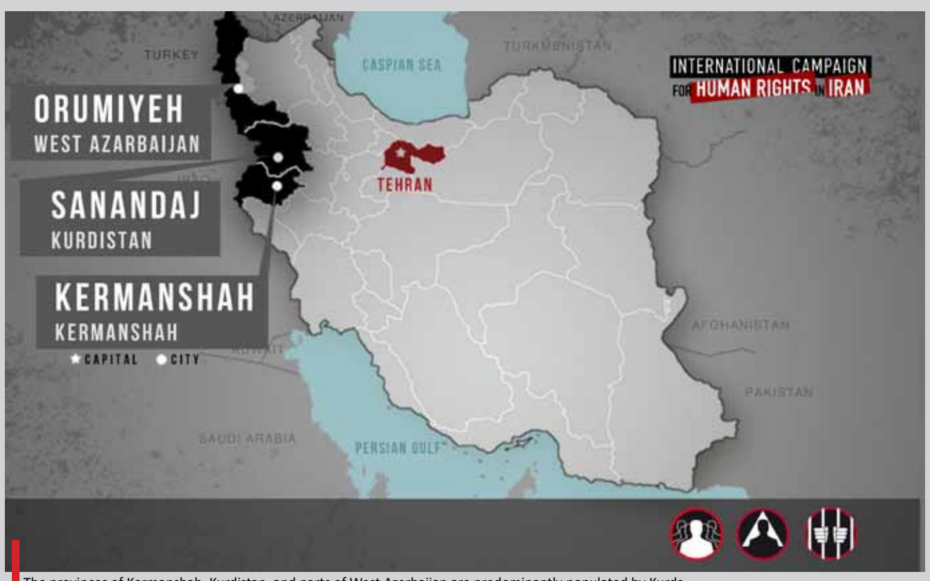
The provinces of Kermanshah, Kurdistan, and parts of West Azerbaijan are predominantly populated by Kurds, an ethnic minority in Iran. The border towns are marked by a general dearth of economic infrastructure and development proportionate to the population, resulting in high rates of unemployment.

Due to the high rate of unemployment, many locals | Massoud Kordpour, a Sanandaj-based journalist engage in transporting and importing foreign goods through unofficial channels in return for a small fee. These kulbar carry packages on their backs or on horses through hard-to-reach mountain passes over borders and into the region's towns and villages. Individuals who transport goods by car into larger towns and the country's central region are called kasebkar or tradesmen. Kasebkar typically employ kulbar.