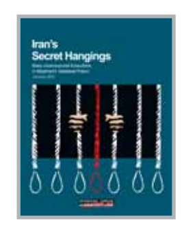
Iran's Secret Hangings: Mass Unannounced Executions in Mashhad's Vakilabad Prison