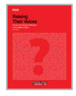
Raising Their Voices: Iranian Civil Society Reflections on the Military Option