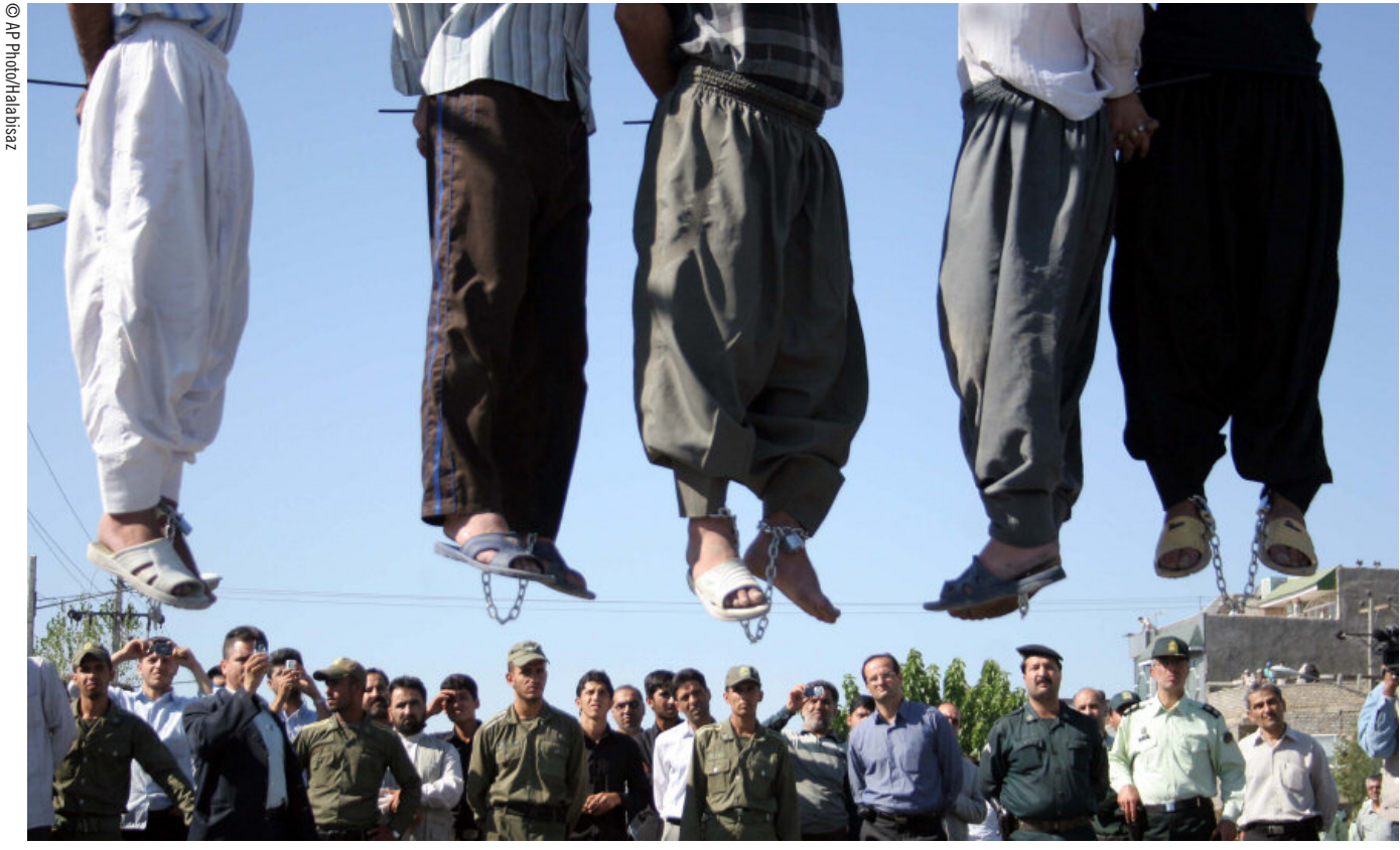
Five men are publicly hanged in Mashhad, Iran, in August 2007.

Every day, prisoners – men, women, even children – face execution. Whatever their crime, whether they are guilty or innocent, their lives are claimed by a system of justice that values retribution over rehabilitation.