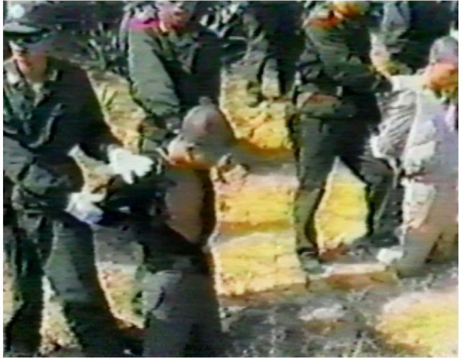
Taken from a videotape, this photo allegedly shows prisoners being prepared for public execution in Fukien province, China, in 1992.

Many governments actively promote the death penalty as vital for crime control. They claim that the threat of execution deters criminals from committing violent crime. For the death penalty to prevent such crimes, potential offenders must be fully aware in advance of the risk of being executed. Yet these same governments, while endorsing the death penalty with one hand, cover up its use with the other.